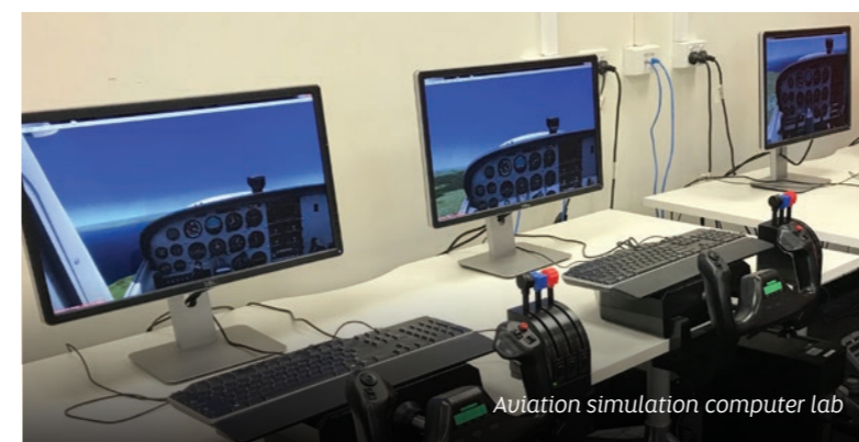
Aviation simulation computer lab