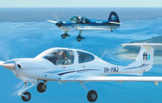
FTA DA-40 aircraft (front)

Boeing Pilot and Technician Outlook 2023-2042