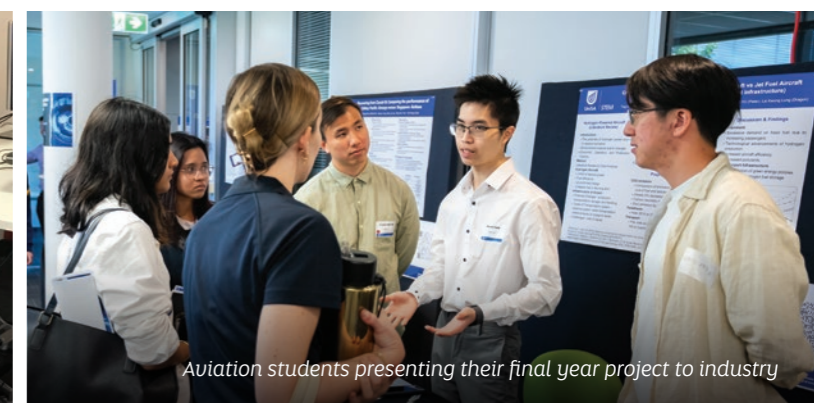
Aviation students presenting their final year project to industry