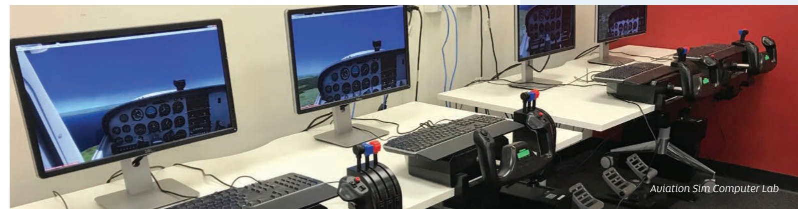
Aviation Sim Computer Lab

Study courses customised to the aviation industry