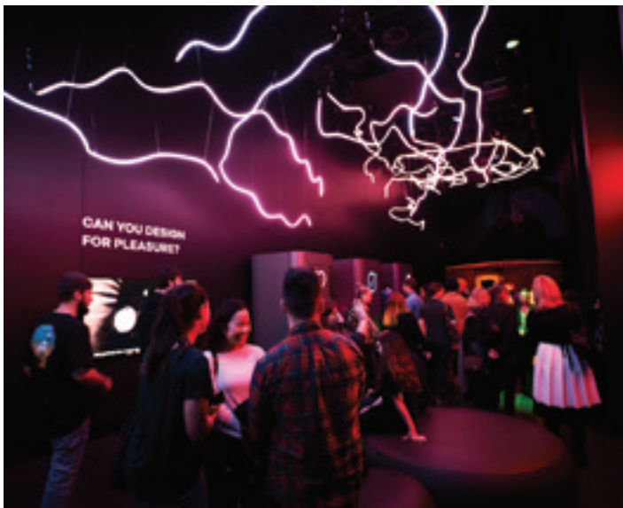
MOD. / Located on North Terrace, this futuristic museum of discovery offers dynamic and thought-provoking exhibitions combining art and science.