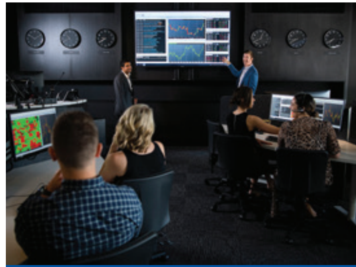
Iress Trading Room / The first of its kind in any South Australian university, this learning space for finance students features the same technology used by the world's leading banks and investment firms.