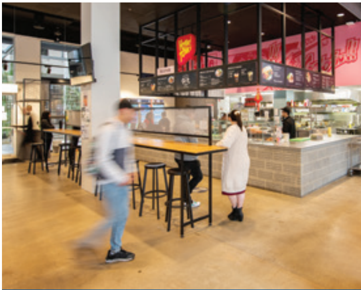
Food vendors / There's lots of delicious food options available on all UniSA campuses.