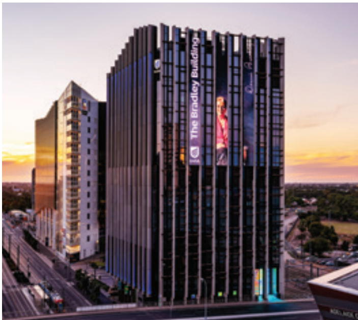
Bradley Building / Home to some of the brightest minds focused on cancer research.