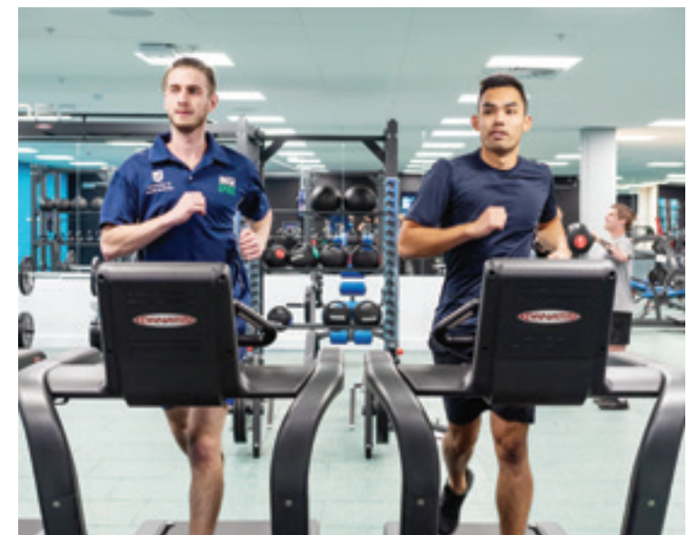
Pridham Hall / Check out the indoor sports centre, fully-equipped gym and lap pool located at City West.