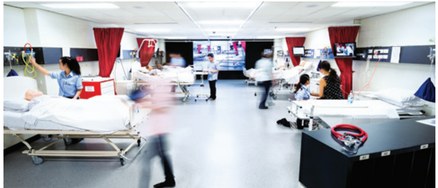
Horizon Hospital and Health Service / Modelled on real health facilities, nursing and midwifery students learn in this simulated environment led by real clinicians.