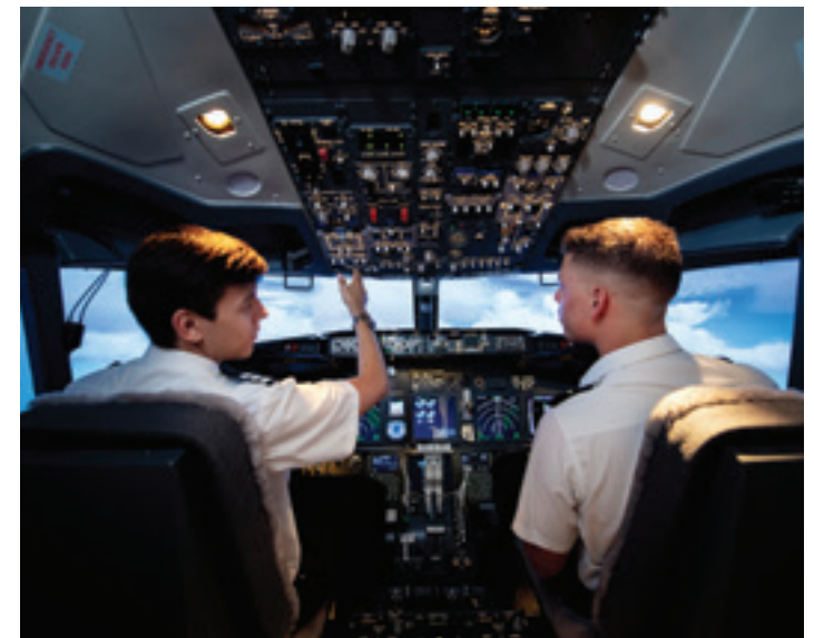
Flight Simulator / Aviation students have access to this state-of-the-art simulator, replicating the Boeing 737NG aircraft.