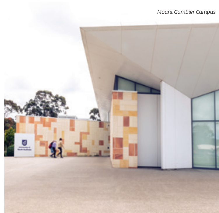
Mount Gambier Campus