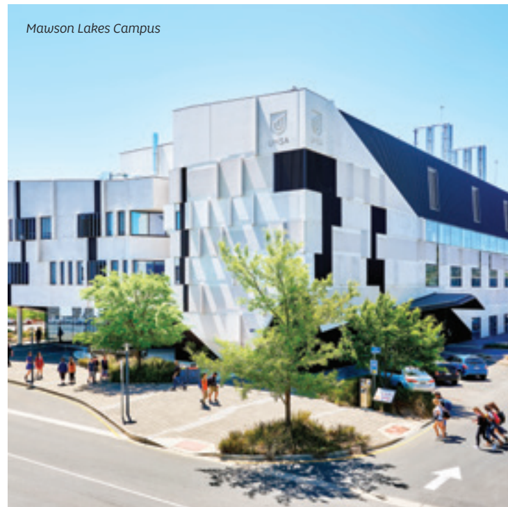
Mawson Lakes Campus