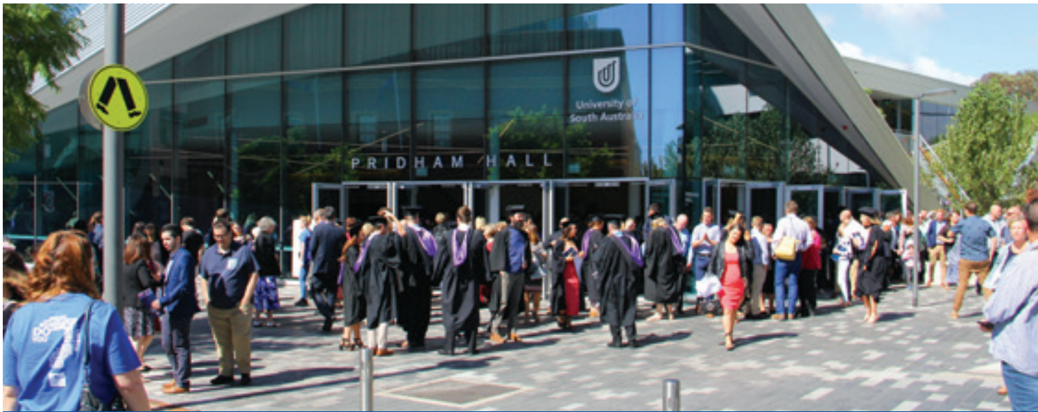
Pridham Hall / The heart of the university and where you'll graduate. It also has open social spaces, sporting facilities, a gym and an underground swimming pool.