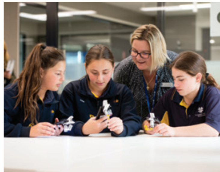
Samsung SMARTSchool / One of Australia's most technologically advanced teacher training facilities.