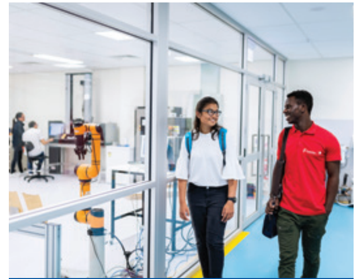
Industry 4.0 Robotics Lab / A space for students and industry to develop new applications for robot programming, machine vision and collaborative robotics.