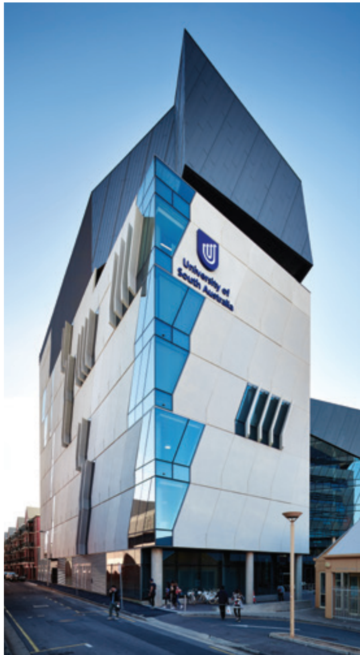
Jeffrey Smart Building / This multi-award winning building is open 24/7, featuring the best in modern learning facilities and has a 5 Green Star Rating.