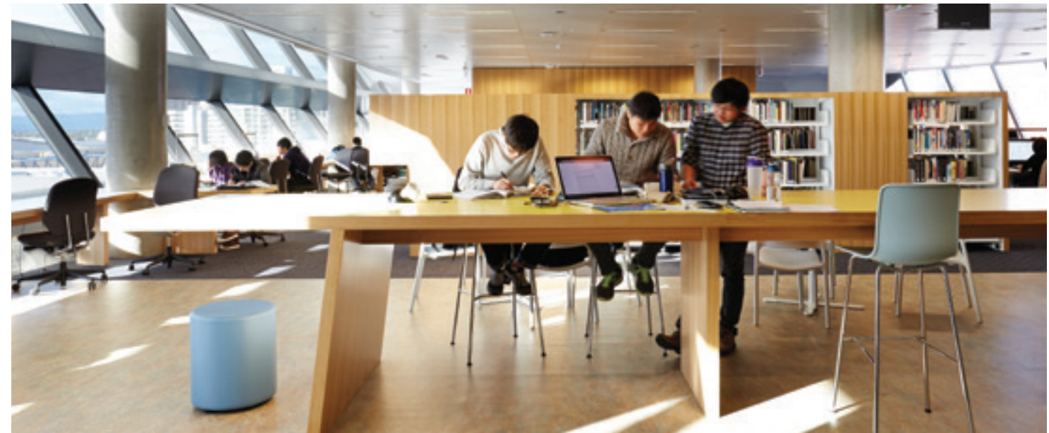
Library / Our library facilities provide a great space to study when you need some quiet time.