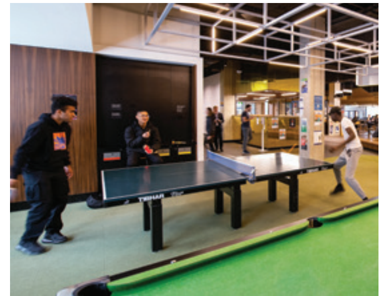
Student lounges / If you're looking for a place to chill, our on-campus student lounges are the best place to hang out.