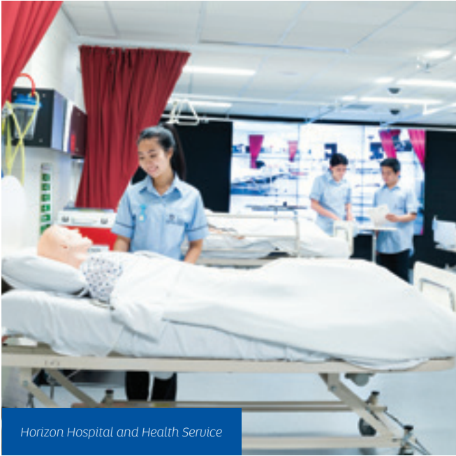
Horizon Hospital and Health Service