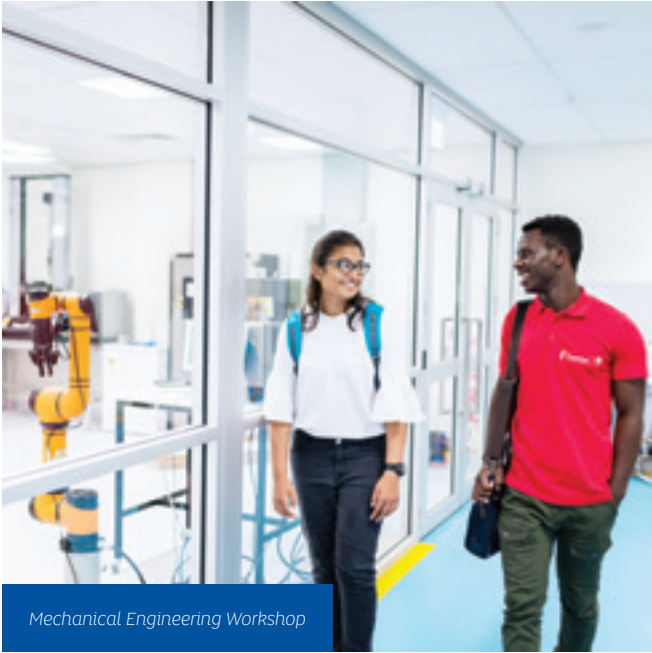
Mechanical Engineering Workshop