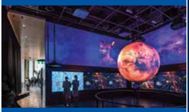
MOD. – explore this on-campus futuristic museum of discovery, offering immersive experiences.