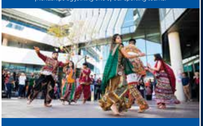
Events on campus – participate in a wide range of events and activities on campus throughout the year.