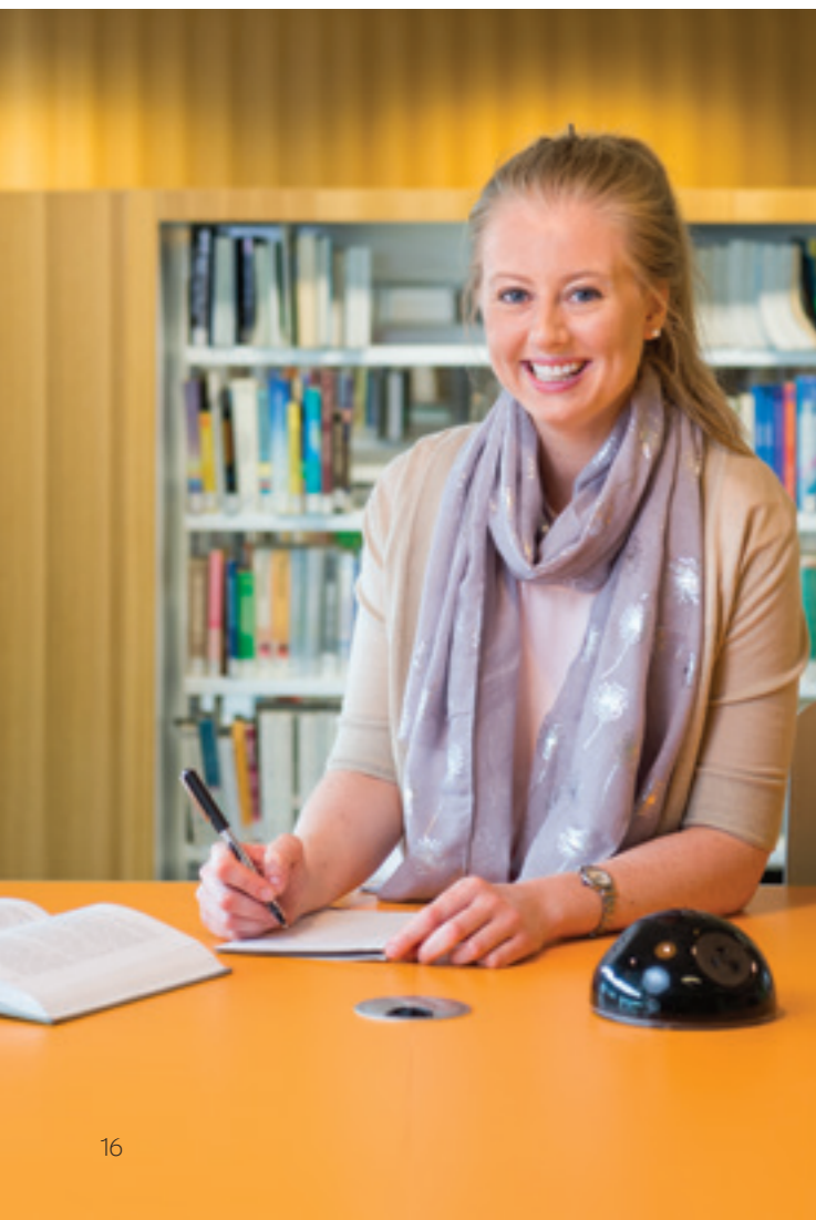
The Student Lounge at City West Campus, where students can study, relax or hang out with friends.

UniSA College programs are offered at City West Campus, but you may also find yourself studying at City East, Magill or Mawson Lakes depending on your course selections. Regional students will also have access to our Whyalla and Mount Gambier campuses, along with our Port Lincoln Study Centre. All of our campuses have modern, purpose-built facilities fitted with the latest tools and technologies to support your learning. You can also get involved with the full UniSA student experience through events, sport, social clubs, volunteering opportunities, overseas study and more.