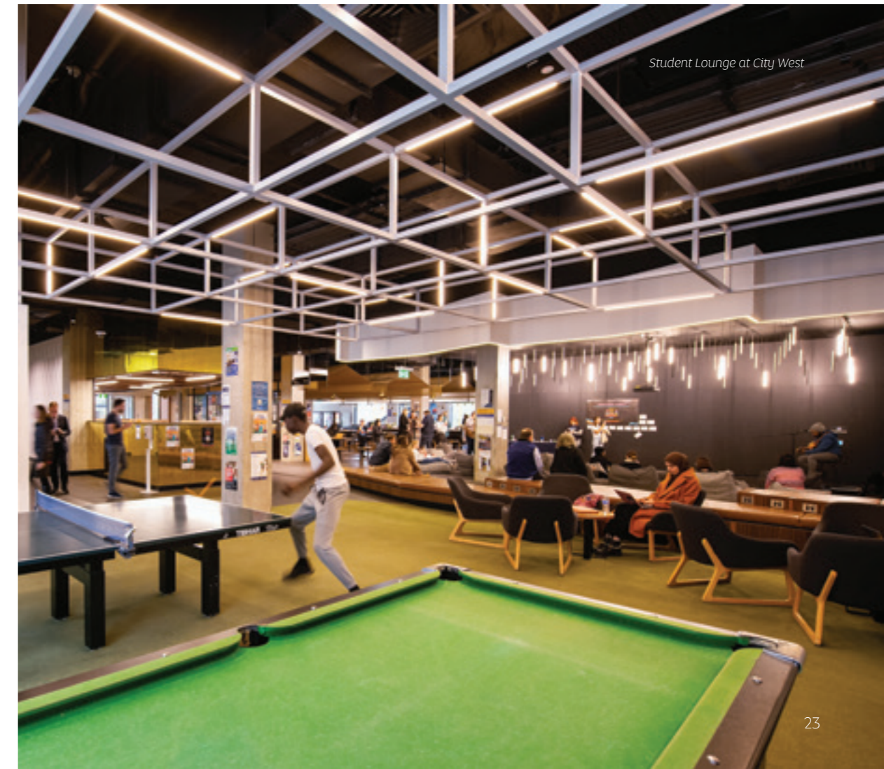
Student Lounge at City West