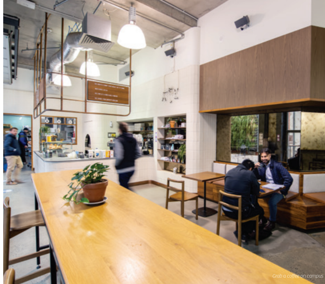
Grab a coffee on campus

At the start of your studies with UniSA College, you'll join an interactive session to build engagement, confidence, and a sense of belonging. You'll hear about university processes, how to develop strong study practices, and more. Along with the course coordinators, you'll also engage in a variety of activities including goal setting, time management and study planning strategies.