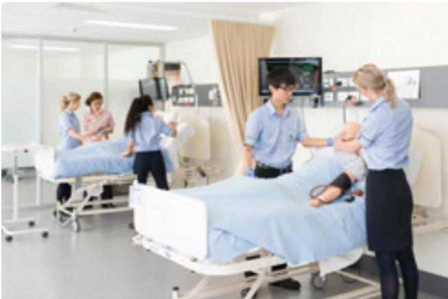
Horizon Hospital and Health Service