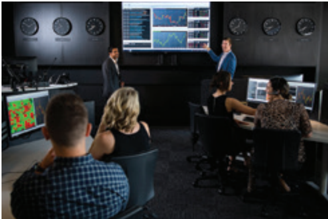
Iress Trading Room