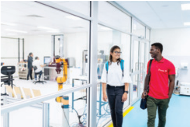
Mechanical Engineering Workshop