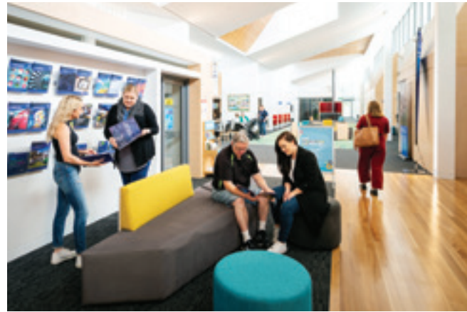
Mount Gambier Learning Centre