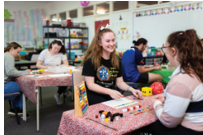
Whyalla Education Studio

Learning Centre • Simulated Hospital Environments • Social Work Studio • Green Screen Recording Studio • Computer Pools • Social and Study Spaces • Gallery